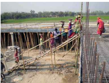
Pouring the roof of the orphanage

We do not yet have the additional $100,000 needed to complete the 2 nd floor of the orphanage. We will use what we have and then see how God supplies the need.